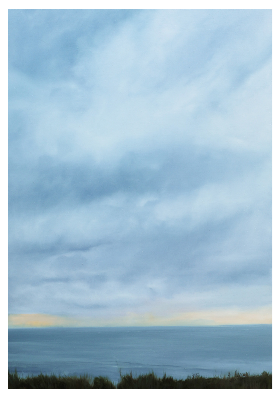
Coastline II oil on canvas with oak frame, 104cm x 73cm 2024 $1880