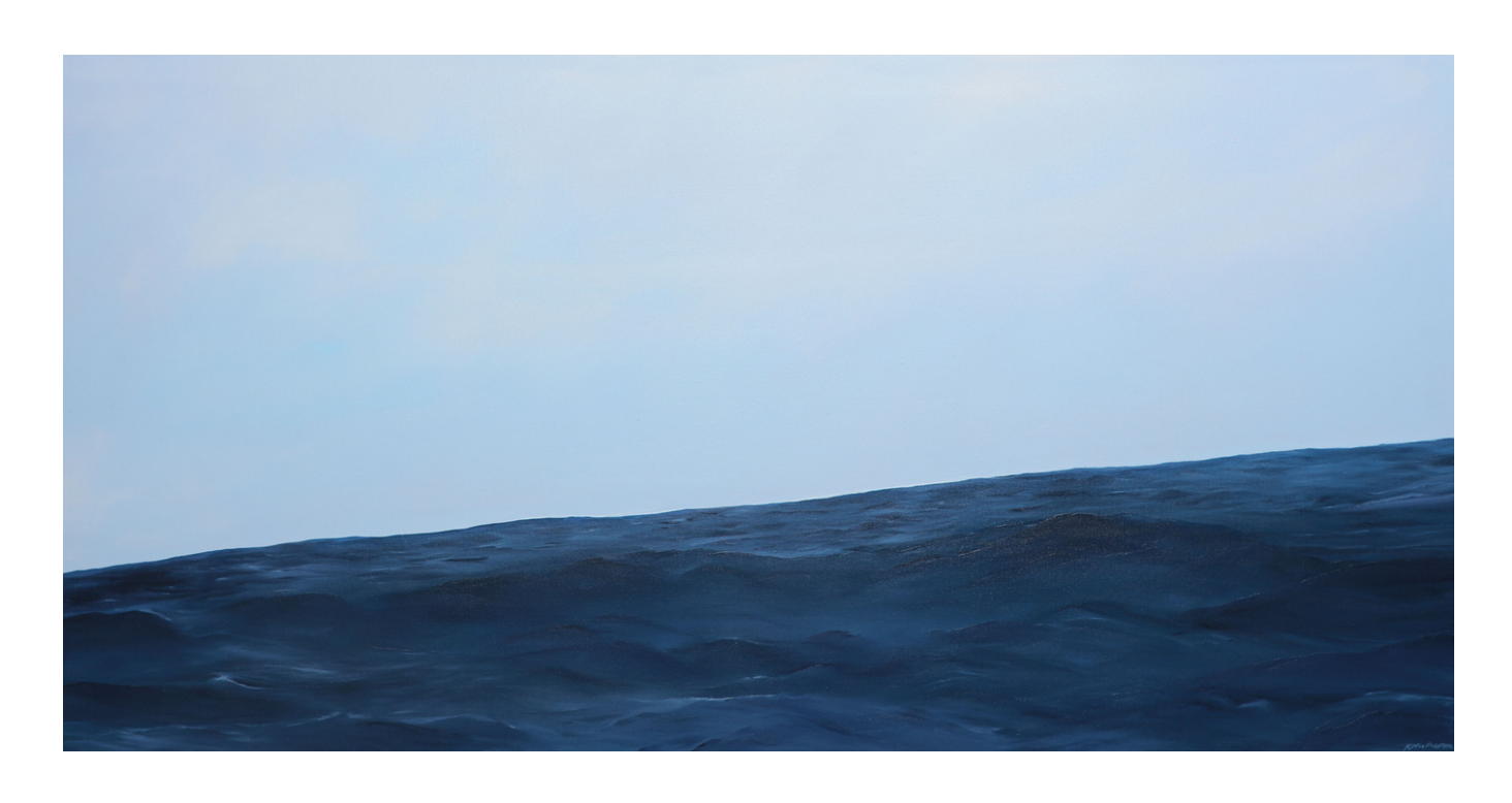
Deep oil on canvas with oak frame, 63cm x 124cm 2024 $1830