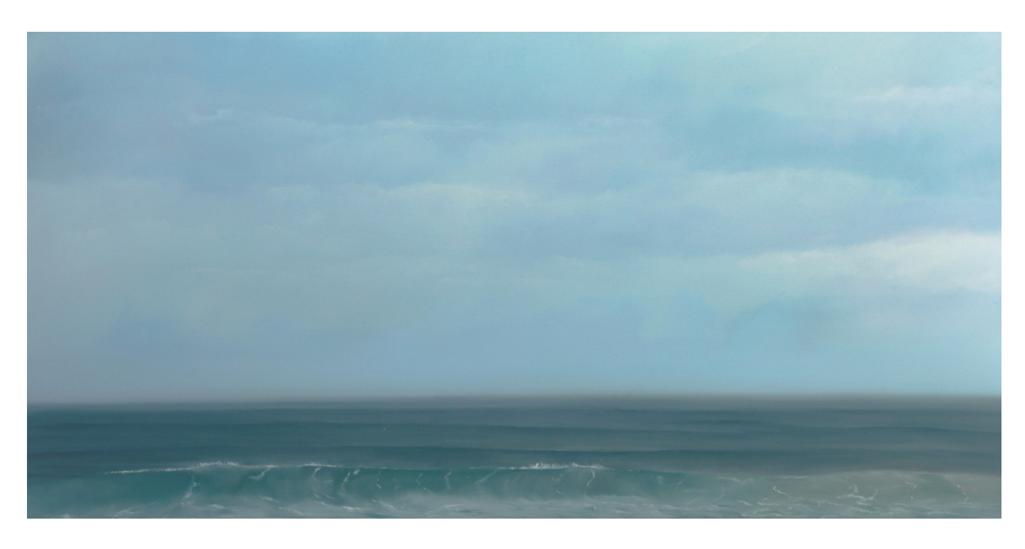
Shoreline oil on canvas with oak frame, 134cm x 68cm 2024 $2100