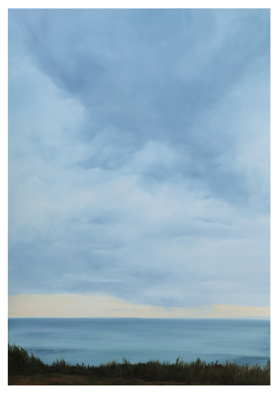
Coastline I oil on canvas with oak frame, 104cm x 73cm 2024 $1880