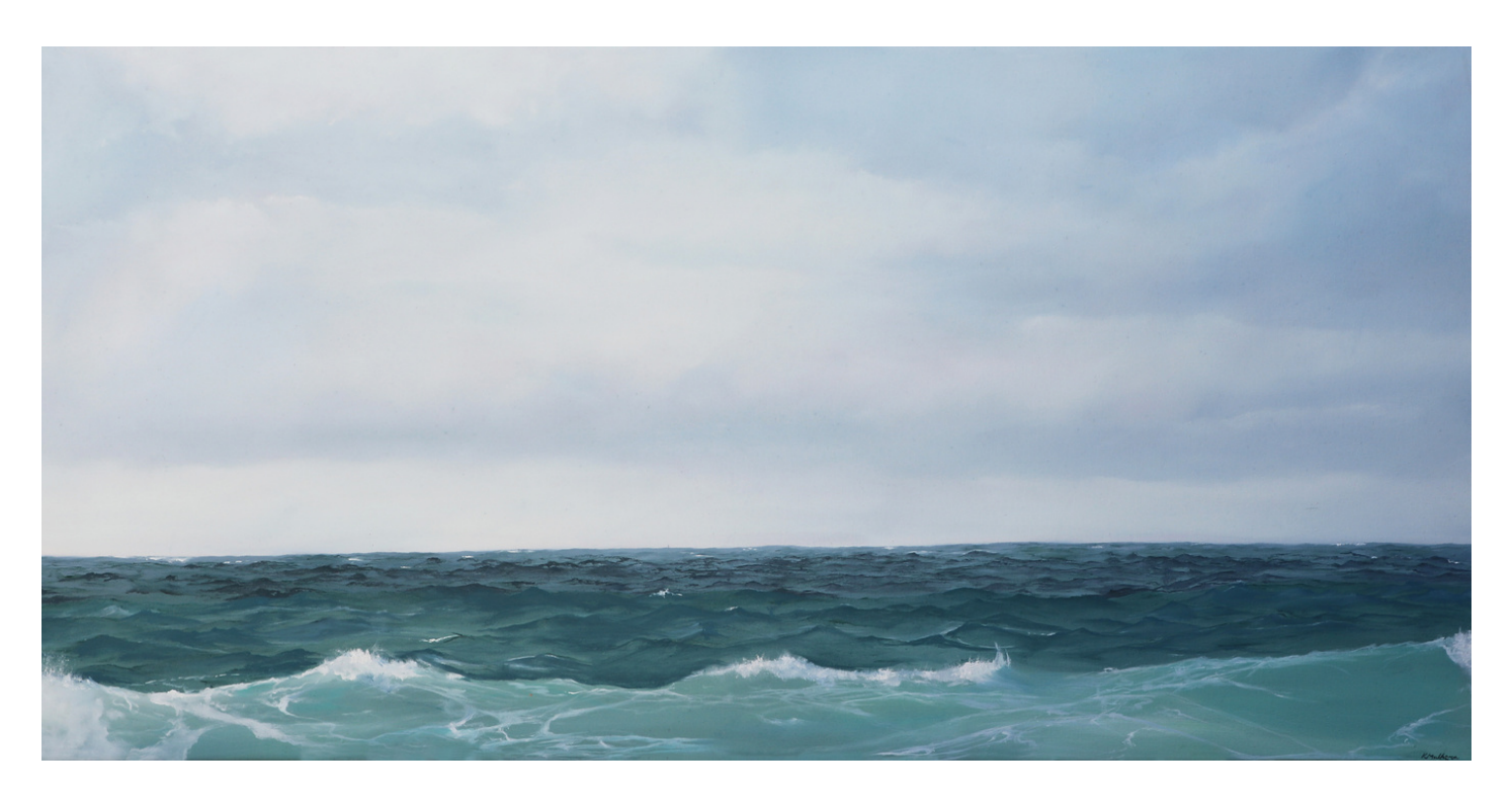
Surface Tension oil on canvas with oak frame, 134cm x 68cm 2024 $2100