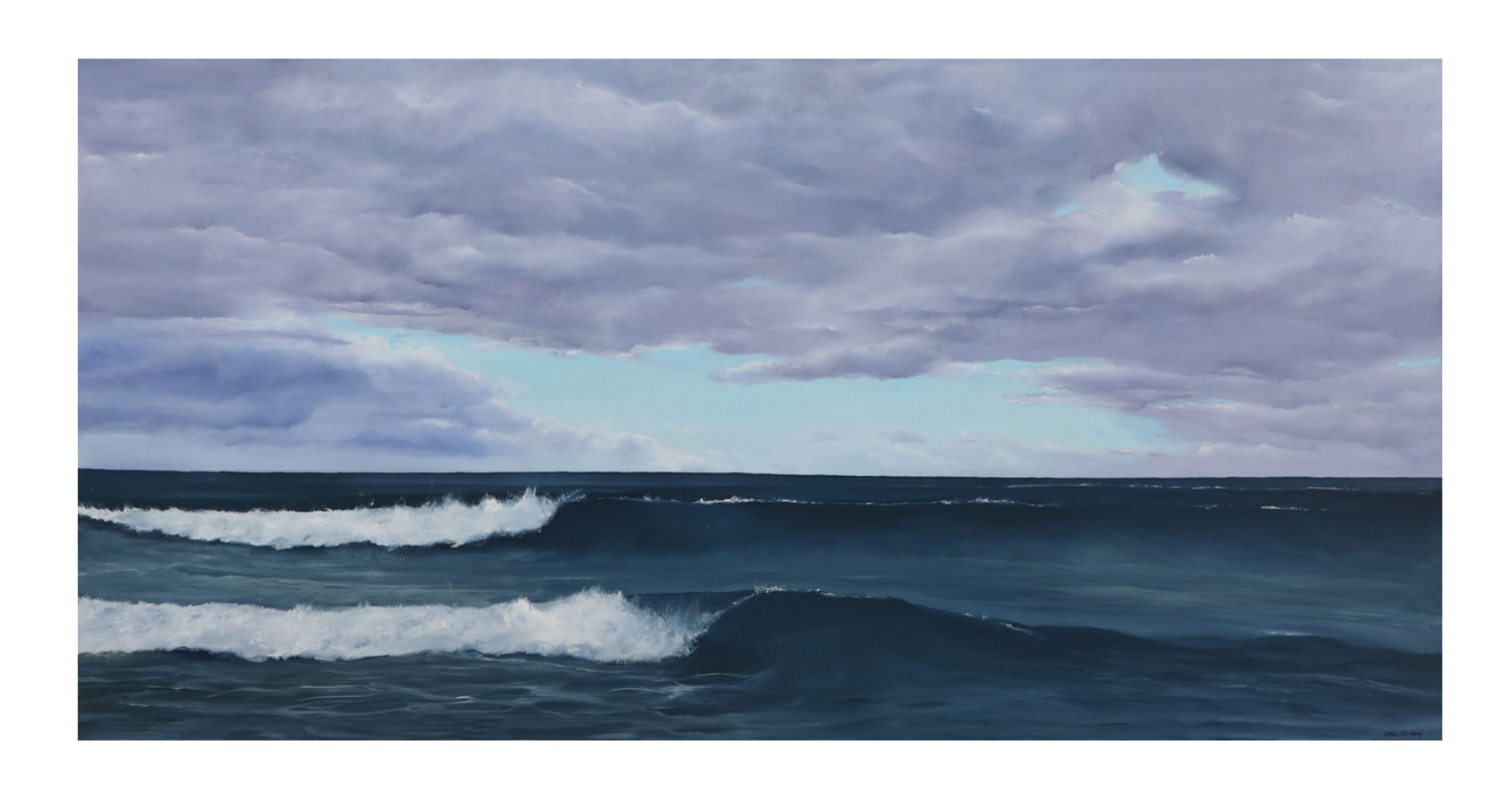
Rolling Waves oil on canvas with oak frame, 63cm x 124cm 2024 $1830