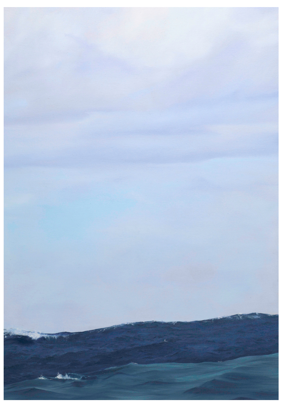
The Swell oil on canvas with oak frame, 104cm x 73cm 2024 $1880