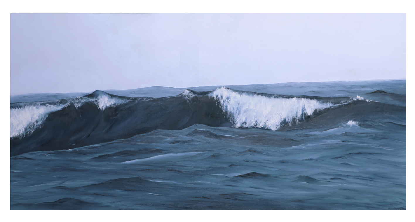
Breaking oil on canvas with oak frame, 63cm x 124cm 2024 $1830